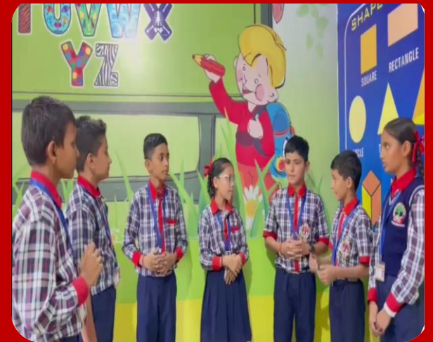
Personality Development & English Communication Lab