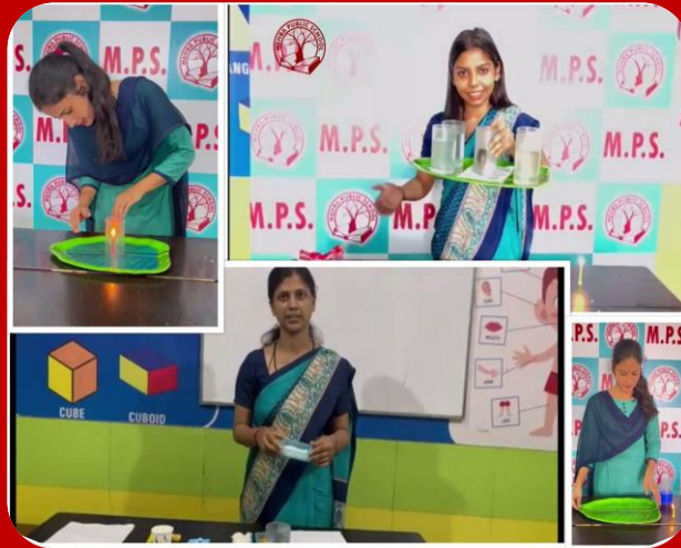
Experimental Science Lab