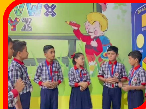
English Communication Class